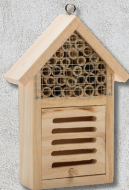
DI 008 150 x 90 x h300