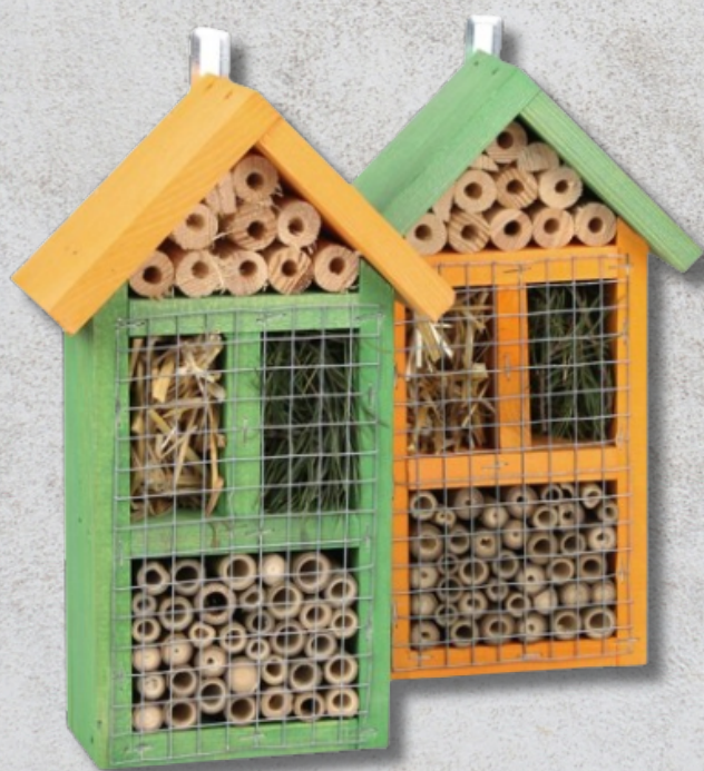
DI 002 180 x 90 x h310