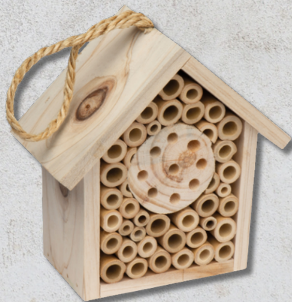
DI 009 120 x 110 x h200