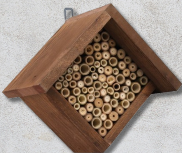
DI 004 240 x 140 x h220