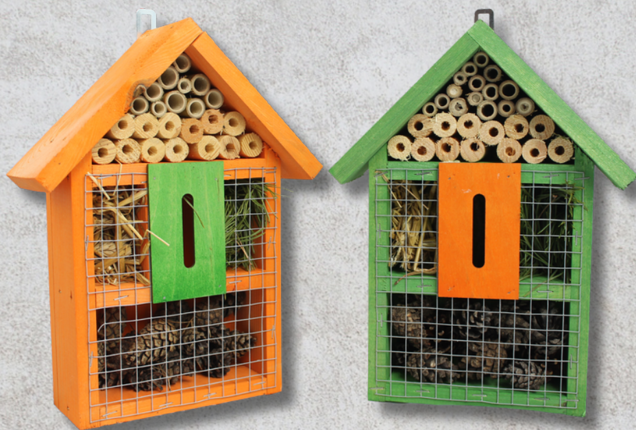
DI 001 240 x 90 x h320

Shipped in a cardboard box or loose on a euro pallet