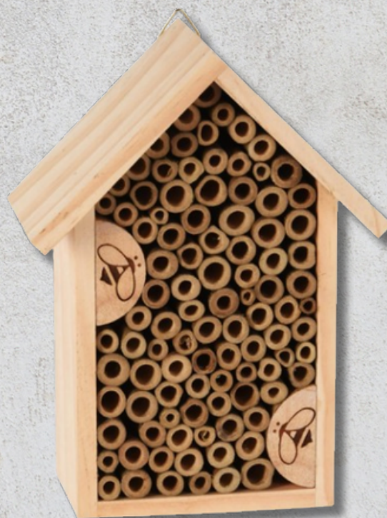
DI 005 150 x 90 x h200