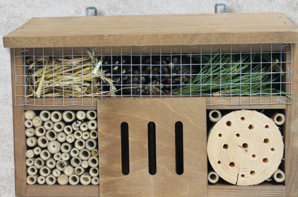
DI 003 370 x 140 x h245

Shipped in a cardboard box or loose on a euro pallet