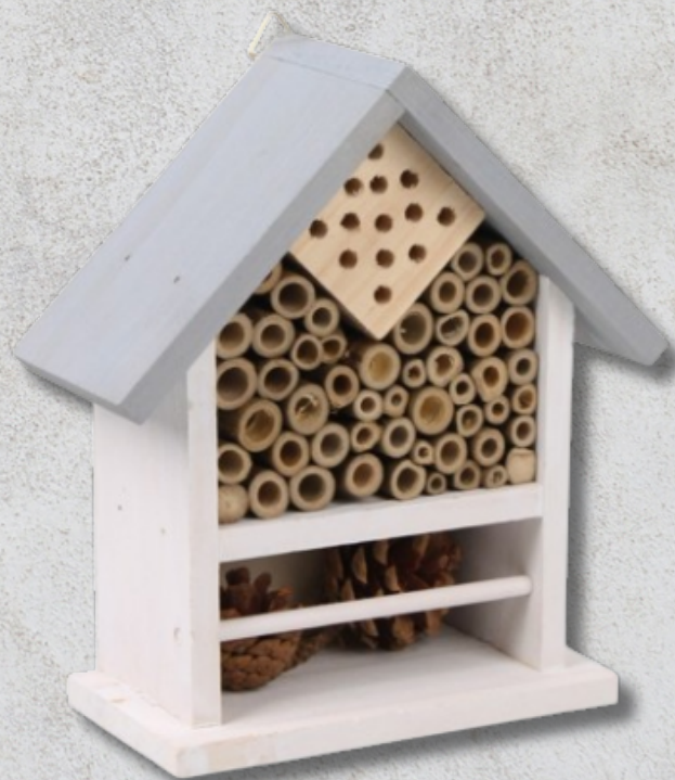
DI 006 240 x 90 x h300