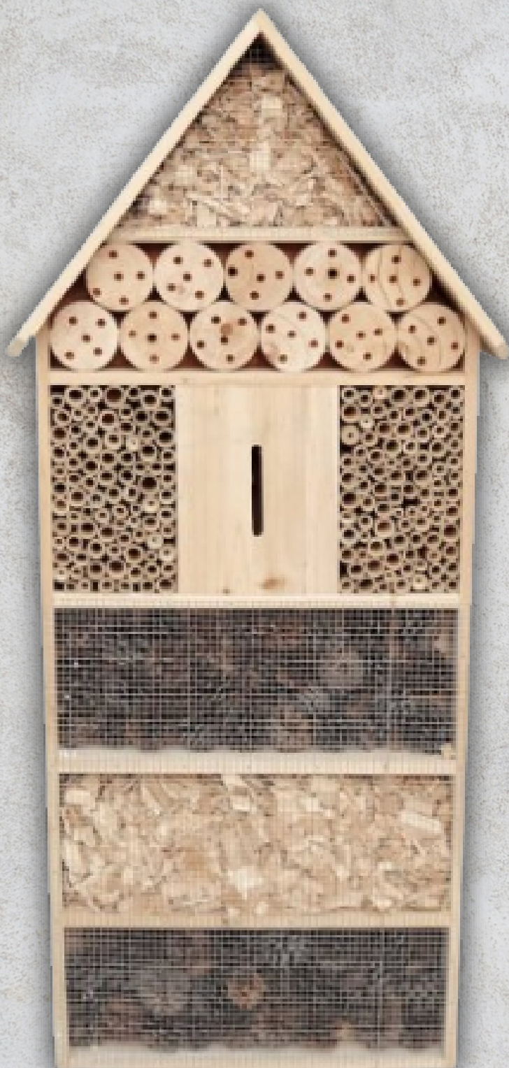
DI 007 450 x 150 x h1000

Shipped in a cardboard box or loose on a euro pallet